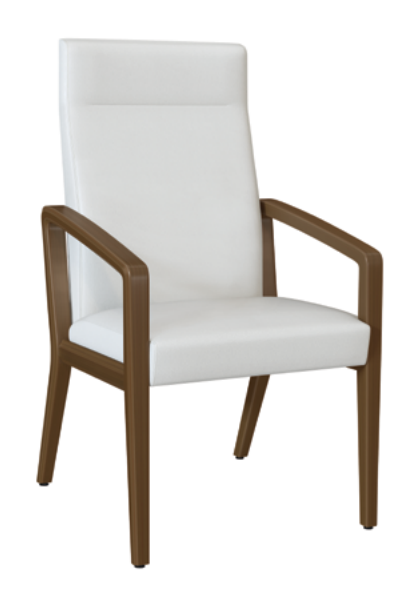
Model: MDAP11 24W 27D 43H 20SW 18.5SD 19SH 26AH

The Modena Patient Chair with Flex Back is designed with a flex frame connecting the seat to the back. This frame enables a modest amount of flexibility in the back only, which adds a level of comfort while waiting. The seat, arms and legs remain stationary providing ergonomic support as the user changes position while unique tapered arms with a faceted edge facilitate ingress and egress. This chair works well in healthcare waiting spaces and patient rooms. It has wallsaver back legs to ensure the walls remain in pristine condition.